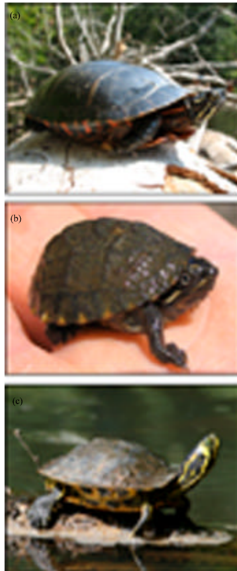
Fig. 1: Photos of turtle species examined in this study. (a) painted turtle ( Chrysemys picta ), (b) juvenile musk turtle ( Sternotherus odoratus ) and (c) yellow-bellied slider ( Trachemys scripta ).

parasites were counted, following descriptions given in Telford (2009). At this magnification, fields of view had an average of 80 ( \pm 13 SD) erythrocytes (Davis, unpubl. data ), so this was equivalent to examining ~8000 cells per turtle. With this value, the number of cells affected by Haemogregarine gametocytes was transformed into a percentage (of erythrocytes) for comparison with other published reports.